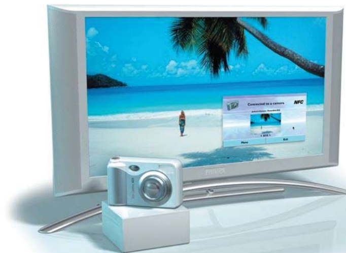
NFC enables the two Bluetooth-enabled devices to exchange communications parameters, establish a secret key, and create a Bluetooth communication link automatically. The devices can then be moved apart as the picture copies securely from one device to the other at Bluetooth speeds.