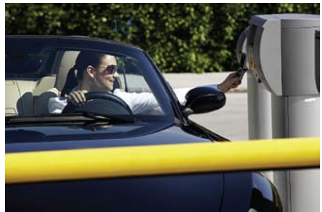
The convenience of NFC is gaining momentum as “seamless traveling” (bundled public transport, parking, etc.) emerges as a future trend.

Transportation is the initial leading use of NFC technology. Contactless tickets have already begun to revolutionize the speed and ease with which all consumers can use public transport and access controlled environments like parking garages. Users praise NFC transactions for their speed, security, and flexibility. With NFC-enabled mobile phones, you can buy tickets, receive them electronically, use them for seamless traveling (such as “Park and Ride”), and then go through fast track turnstiles while others wait. Later, you can check your balance or update your tickets remotely. The cost of providing mass transport or event ticketing will be driven down because NFC-based systems reduce the cost of card issuance and management. Commuter transit systems in Europe and a number of Asia Pacific countries already use NFC-compatible contactless technologies to speed travelers through to their destinations.