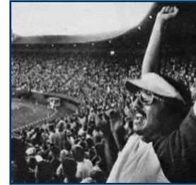
Ticketing and Access